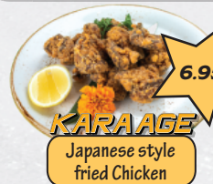
KARAAGE Japanese style fried Chicken

Serrano chile . Crispy Onions . Spicy Mayo