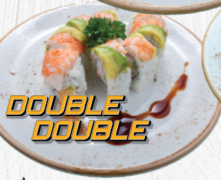
★ DOUBLE DOUBLE

★ "Consuming raw or undercooked meat, poultry, seafood shellstock eggs may increase your risk of food borne illness"