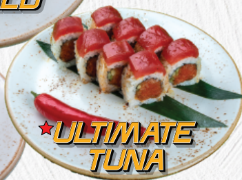
★ ULTIMATE TUNA