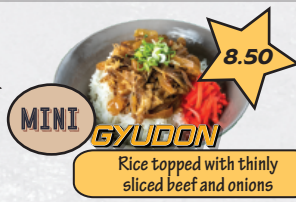
MINI GYUDON Rice topped with thinly sliced beef and onions